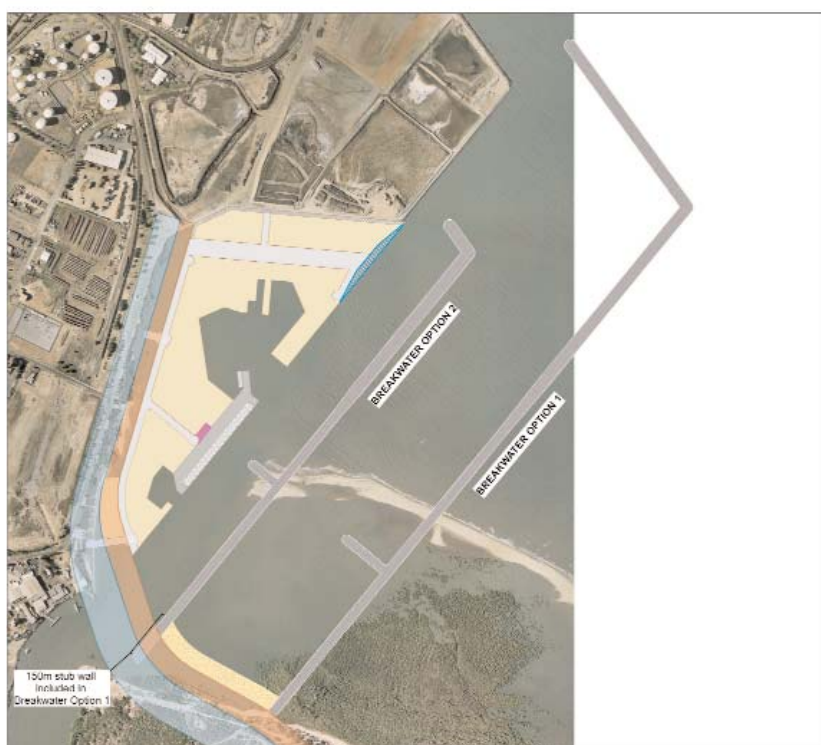
Concept drawing of possible marina layout and potential breakwater options

The Port of Townsville has already completed preliminary studies, particularly environmental investigations over the past 10 to 15 years. Such studies included migratory bird surveys, surveys of